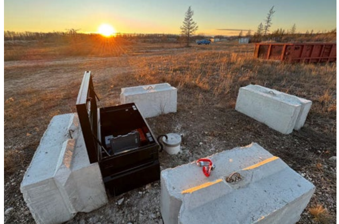
Secure Aquahive monitoring installation on Sio Silica site (Borehole 92-8)

This approach allowed stakeholders — including Indigenous groups, local residents, and regulators — to access near-real-time information rather than relying solely on summarized reports.