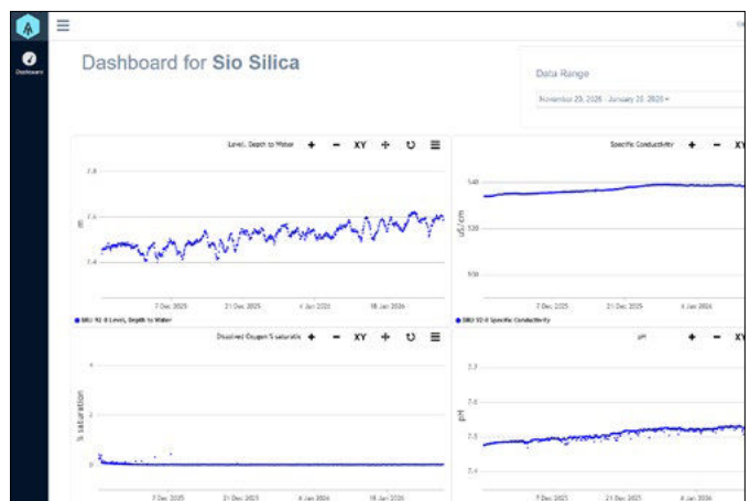
The Sio Silica dashboard presents all data in an easy to view interface