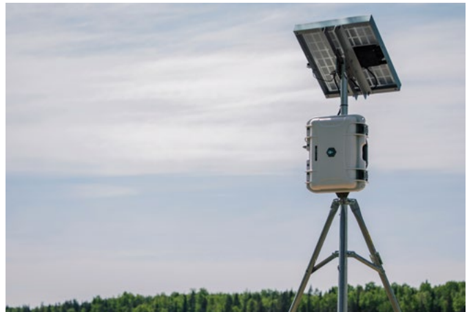
Aquahive supports solar and wind power with cellular and satellite communications