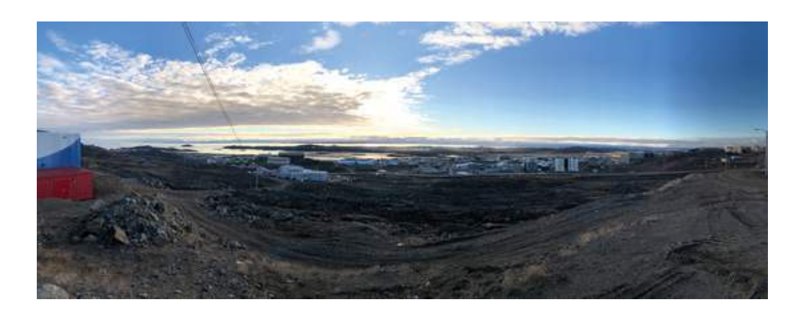
The City of Iqaluit viewed from the water treatment plant. Iqaluit has approximately 7500 residents and is the capital city of Nunavut. The drinking water system for this arctic city is unique in its use of an above ground utilidor to keep pipes from freezing in the winter.

Aquatic Life swiftly implemented a s::can micro::station, equipped with an online spectrometer (spectro::lyser), for real-time monitoring of hydrocarbon contamination. The Aquatic Life team collaborated with s::can and WSP engineers to develop custom hydrocarbon algorithms, enabling precise analysis and detection of contaminants. By incorporating advanced technologies and leveraging extensive water monitoring expertise, Aquatic Life enabled prompt decision-making and optimal process control.