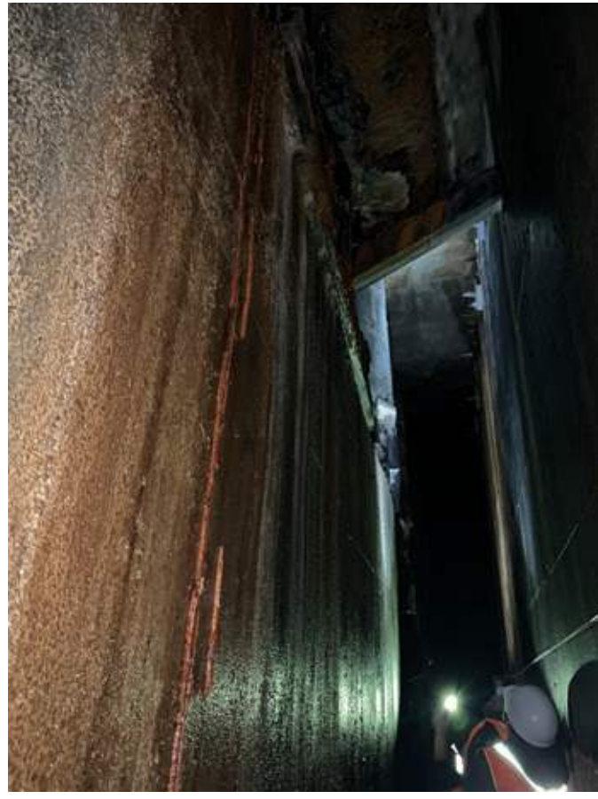
Pictured on the right: The engineering team discovering and examining the remnants of the diesel tank in the void. The tank was for a fire protection pump when the plant was first constructed.