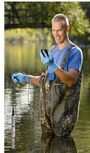
Get accurate results and long-lasting calibrations.