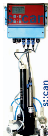
nano::station with con::lyte

The s::can nano::station - compact, precise and affordable!